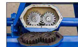
4 - Speed Gear Box